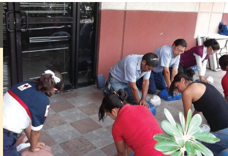
Norgren employees practice CPR as part of the annual health and safety training programme.

Importantly, the programme has given managers greater ownership of budgets to