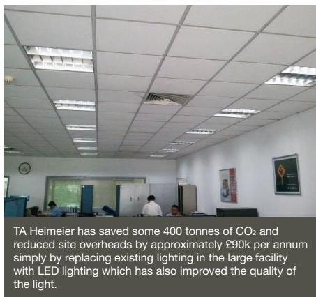
TA Heimeier has saved some 400 tonnes of CO 2 and reduced site overheads by approximately £90k per annum simply by replacing existing lighting in the large facility with LED lighting which has also improved the quality of the light.

Climate change is a key driver for energy management as it influences our internal energy use as well as our product and service innovation. As a result, IMI has an on-going commitment to reduce its CO 2 emissions and become more energy efficient in both the manufacture of our products and the processes we use to engineer them.