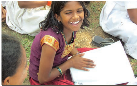
Young student at school in Bangalore, India.

shoes, clothes, toys and stationery for every student. The 'Reach Out' initiative has proved popular with employees and those involved hope to continue their work in education, and aim to promote the importance of educating girls in a region where it is not deemed a priority.