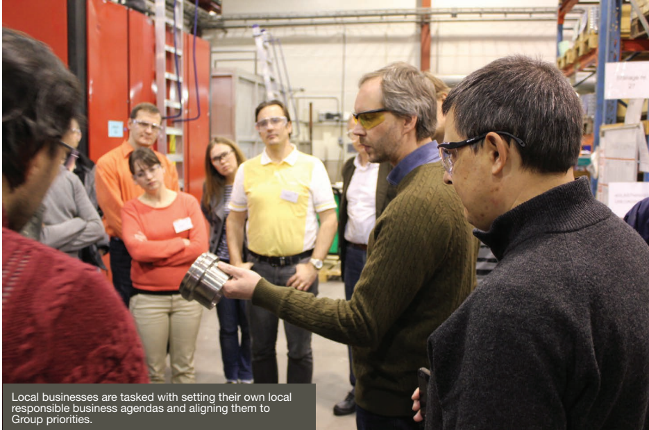
Local businesses are tasked with setting their own local responsible business agendas and aligning them to Group priorities.