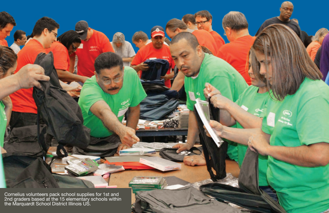
Cornelius volunteers pack school supplies for 1st and 2nd graders based at the 15 elementary schools within the Marquardt School District Illinois US.