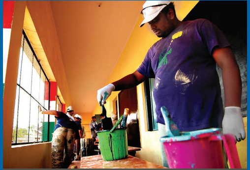
CCI employees decorate a school in Bangalore, India.