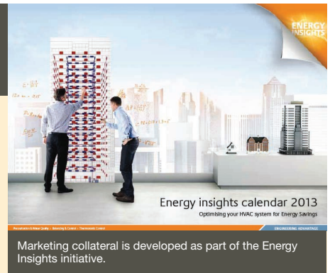
Marketing collateral is developed as part of the Energy Insights initiative.

Key elements of the campaign include the fact book which incorporates 20 separate