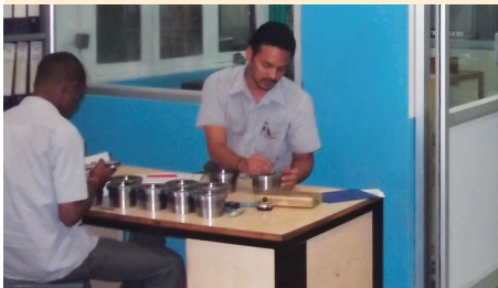
Accutech Enterprise employees work in a clean and safe environment.

Auditors also praised Accutech's investment in training and development, especially those which focused on technical skills and team building.