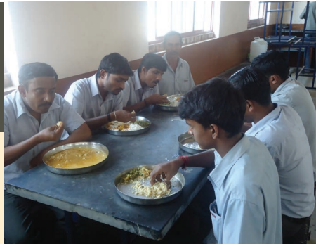
Employees at Accutech Enterprises benefit from a conscientious employee welfare programme.

Over the last couple of years, Accutech has significantly improved health and safety in the workshop and have impressed auditors with a conscientious employee welfare programme which helps Accutech attract and retain people in a very competitive region.